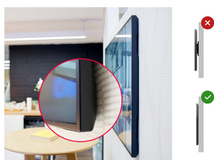
Zero-Gap Wall Mount

Designed to perform in continual, around the clock environments, the LH6570UHB can be installed and utilised in landscape and portrait orientation. The jaw dropping and best-in-class 35mm total depth (when used with the included proprietary brackets) will mean this display can be installed discretely and elegantly in all areas.